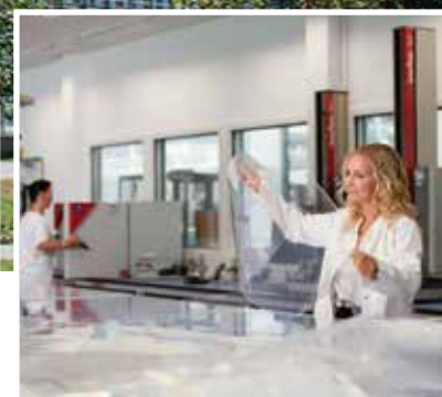
Chemical & film laboratory