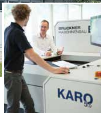
Laboratory stretching frame