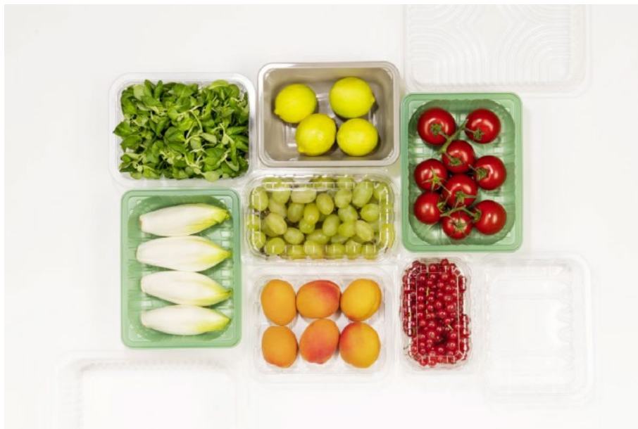
Variety of high-quality polymer trays. © KIEFEL GmbH