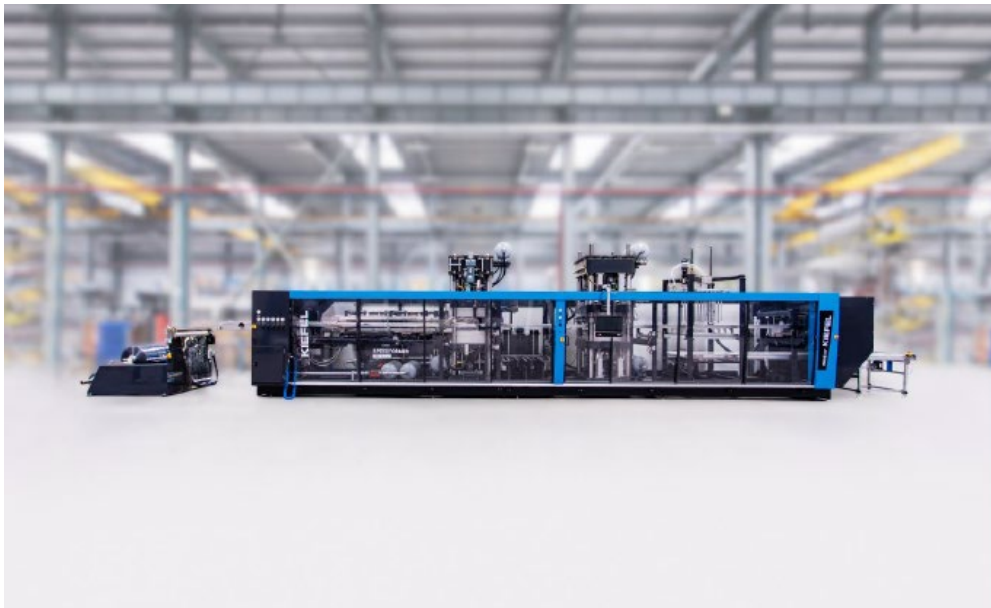
KMD 90 Smart for fast and efficient thermoformed-packaging production.