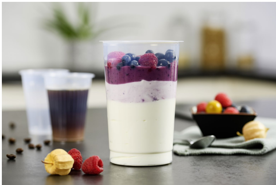
Heat-resistant C-PET light cups as sustainable alternative to PS and PP.